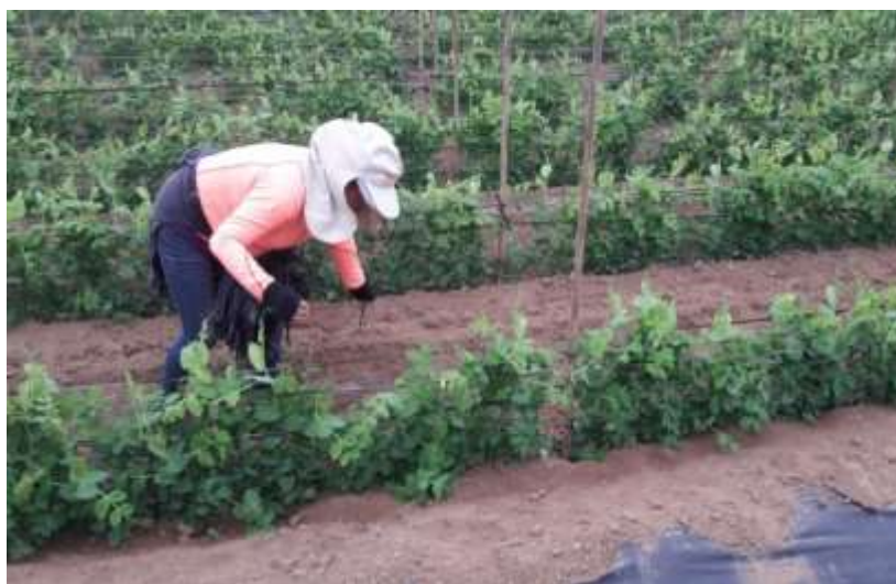
Figura 2. Woman in process of mooring in Holantao