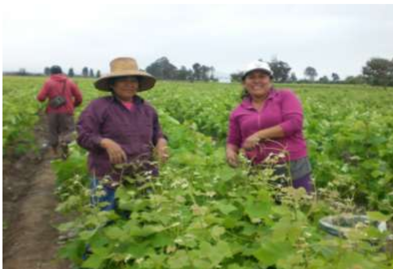
Figure 1. Outbreak of vine leaves of women in the field

The situation of women in the Cañete Valley is not alien to this reality, where the workforce of women is highly valued in various productive activities in the countryside with a greater incidence in plantings, harvesting of fruit trees, classification among other agricultural activities, which inculcate in improving their living conditions, work, family and community development, as shown in figure 1, after vine leaves, for the beginning of fruiting in the agricultural fields of the Center La Esmeralda Village, San Vicente – Cañete.