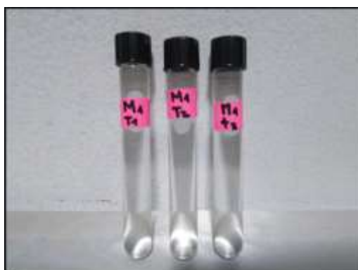
Figure 2. Final samples after treatment with micronanobubbles and graphene

In Figure 1 the initial samples of the tributaries are observed before the treatment with micronanobubbles of air and graphene, where a high turbidity can be observed according to the color they present.