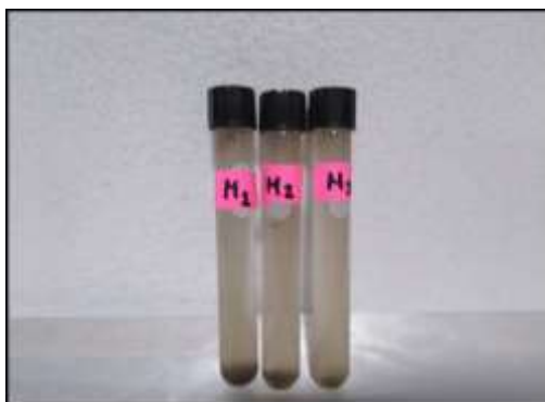
Figure 1. Initial samples without treatment.

In Figure 1 the initial samples of the tributaries are observed before the treatment with micronanobubbles of air and graphene, where a high turbidity can be observed according to the color they present.