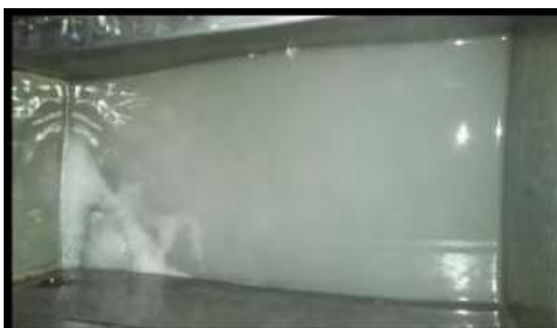
Figure 3. Application of the treatment and sample extraction

The treatment was performed in 3 repetitions, using for each of them, 18 liters of water, in intervals of 10 minutes, 15 minutes and 20 minutes.